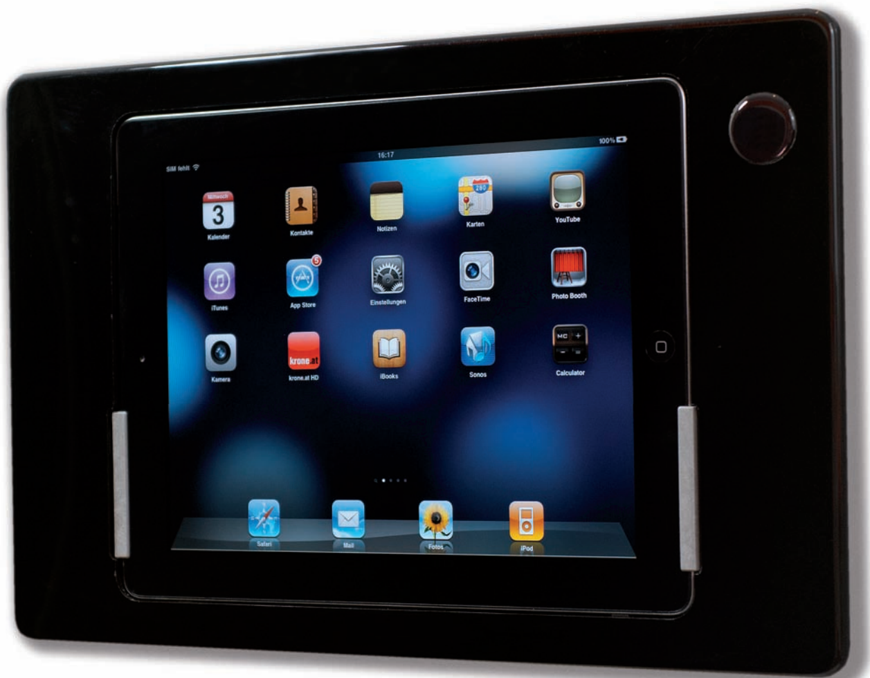
iRoom's iDock Landscape