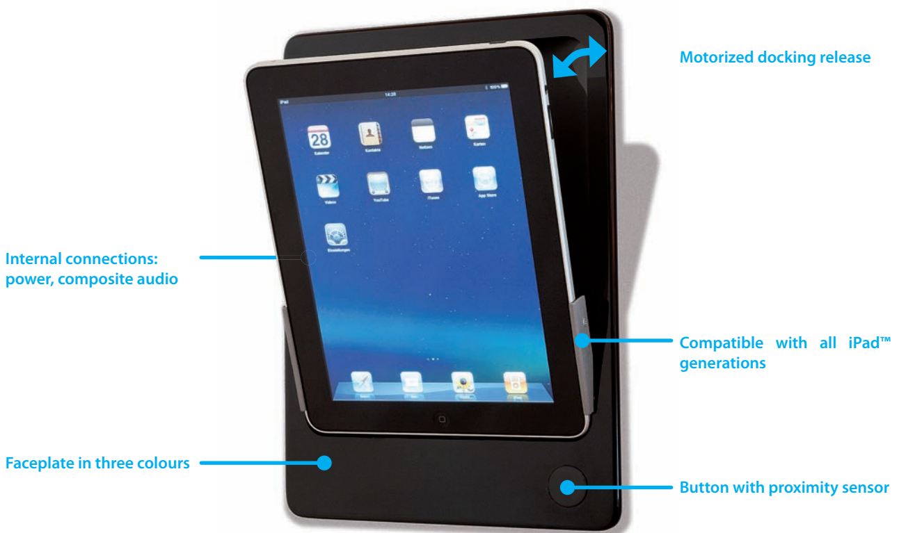
iRoom's iDock Portrait

iRoom's iDock is noted for its brilliant design, clever engineering and high quality materials and is manufactured to the most stringent European standards. Thanks to all stages of concept to manufacture residing within the iRoom factory in Salzburg, iRoom prides itself on its ability to react to market needs and deliver products to market quickly. – All iRoom products come with a 2-Year warranty.